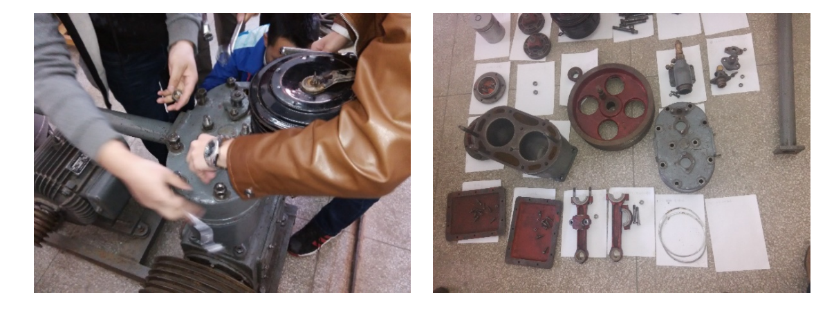
Figure 1: Maintenance site.

The process equipment and control engineering major is conducted through professional activities at the NEPU with three classes for a total of 90 students. Each class is supervised by two instructors, and students are divided into three groups of 10 students each. Students are free to form their teams for teamwork; however, each team should include at least two females. The team leader is responsible for the preparation of the work, and is responsible for the joint production of team assignments. He or she is also responsible for the election of a deputy leader and a security officer, whose tasks are to assist the group leader. The maintenance site and the disassembled parts are shown in Figure 1 and Figure 2.